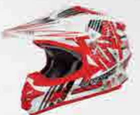
MODEL CODE G8008 STAR - WHITE/RED