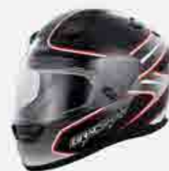
MODEL CODE L9999 ENIGMA-BLACK