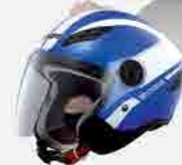
MODEL CODE EDGE BLUE / WHITE