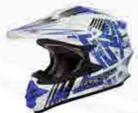
MODEL CODE G8008 STAR - WHITE/BLUE