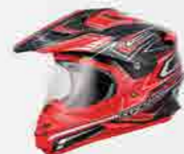
MODEL : CODE G8888M : ML - RED