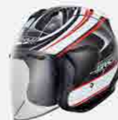
MODEL : G818 CODE : URBAN - BLACK