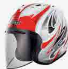
MODEL : G818 CODE : BZ-WHITE / RED