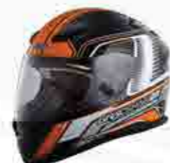
MODEL CODE G9999 SCK-ORANGE