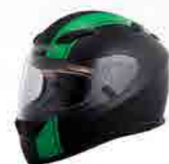
MODEL CODE G9999 GC-GREEN