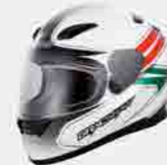
MODEL CODE L9009 ENIGMA-WHITE