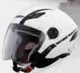
MODEL CODE EDGE WHITE / BLACK