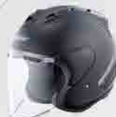
MODEL CODE G818 JET BLACK