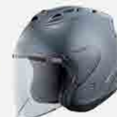
MODEL CODE G818 METALLIC GRAY