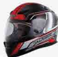
MODEL CODE G9999 SCK-RED