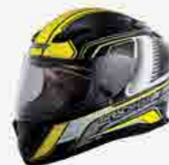
MODEL CODE G9999 SCK-SILVER