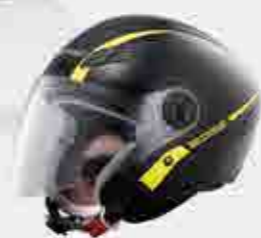
MODEL CODE EDGE BLACK / YELLOW