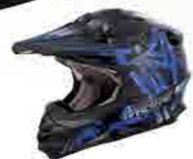
MODEL CODE G8008 STAR - BLACK/BLUE

FEATURES: Fully Detachable Interior Liner and Cheek Pads Wide Peripheral Vision