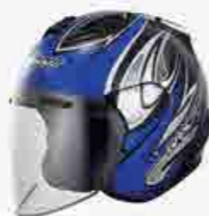
MODEL : G818 CODE : BZ-BLACK / BLUE