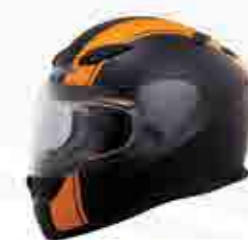
MODEL CODE G9999 GC-ORANGE