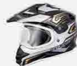
MODEL : CODE G8888M : ML - GOLD

Fully Detachable Interior Liner and Cheek Pads Wide Peripheral Vision