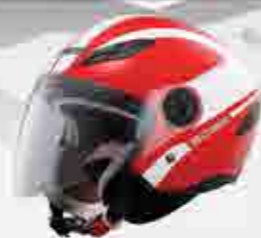
MODEL CODE EDGE RED / WHITE