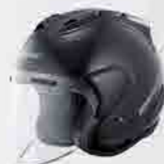
MODEL CODE G818 GLASS BLACK