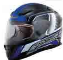
MODEL CODE G9999 SCK-BLUE