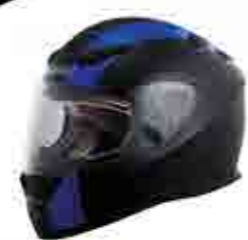
MODEL CODE G9999 GC-BLUE