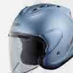
MODEL CODE G818 SAPPHIRE SILVER