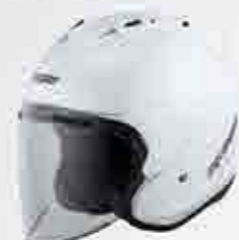
MODEL CODE G818 GLASS WHITE