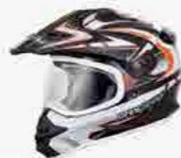
MODEL CODE G8888 BR - BLACK

FEATURES: Fully Detachable Interior Liner and Cheek Pads Wide Peripheral Vision