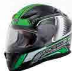
MODEL CODE G9999 SCK-GREEN