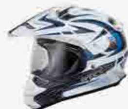
MODEL CODE G8888 BR - WHITE