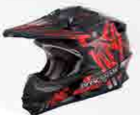
MODEL CODE G8008 STAR - BLACK/RED