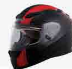
MODEL CODE G9999 GC-RED