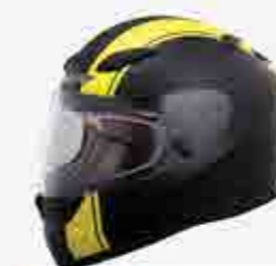
MODEL CODE G9999 GC-YELLOW