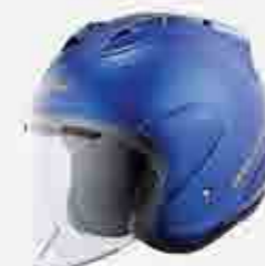
MODEL CODE G818 GLASS BLUE